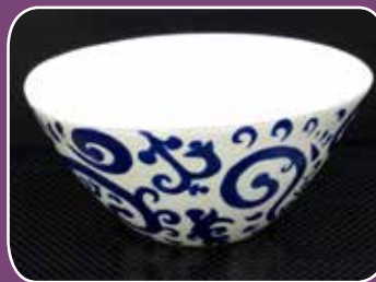
(left) handmade porcelain bowl by Lush For Life $65